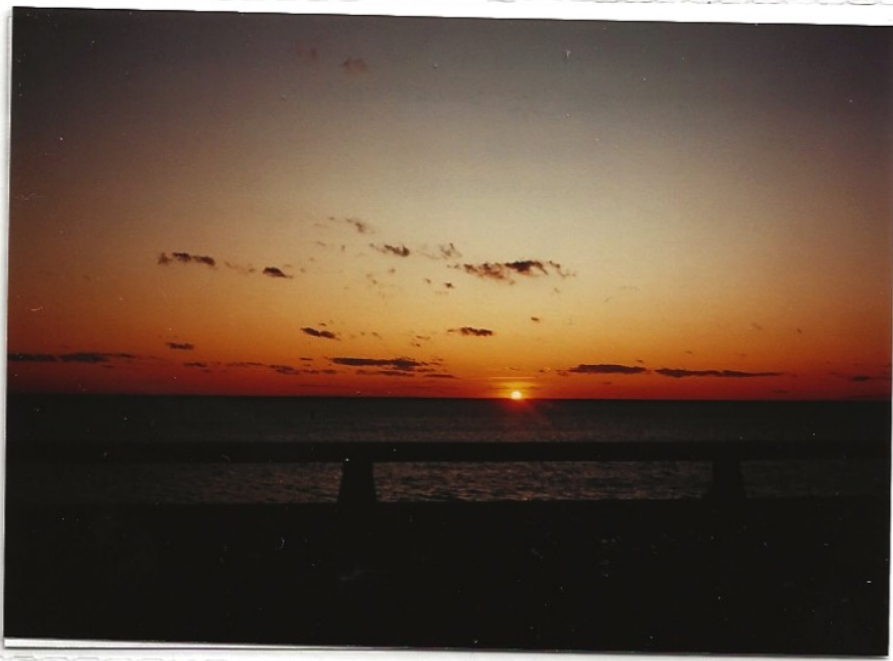
Sunset from Bridge at Hooper Island Is Oct. '92