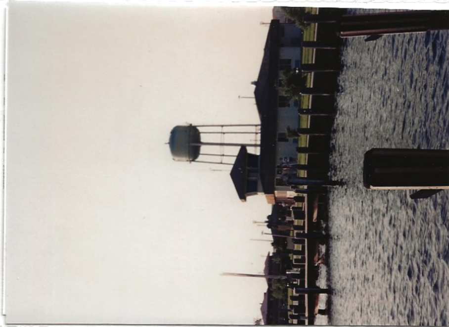
Crisfield, MD Going into Somer's