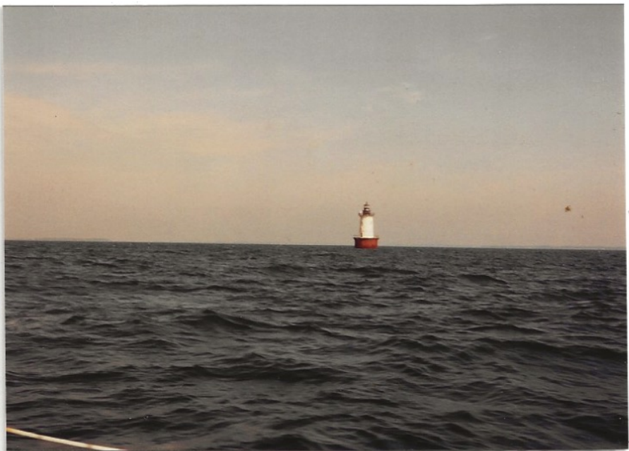
Hooper Island Light 5 57 ft 9 miles