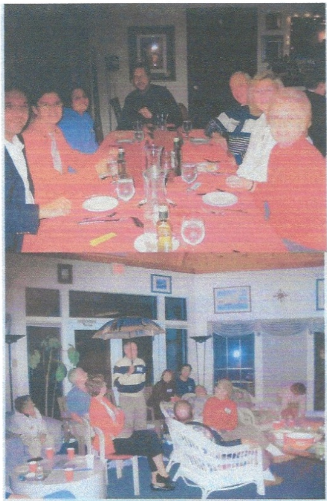
under his new umbrella.