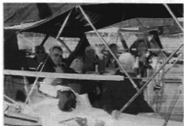
Keep Smiling. I Think He's Bringing Food!