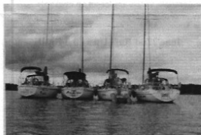
You Think Those Clouds Mean Wind and Rain?

It is important to help maintain the membership level of our Fleet. Please talk with Catalina 34 owners that you meet on the Bay and encourage them to try one of our raft-ups or come to the Fall meeting. Carrying an extra copy or two of the Dockline and leaving one on a Catalina 34 that you see on the Bay can also alert non-members to our organization.