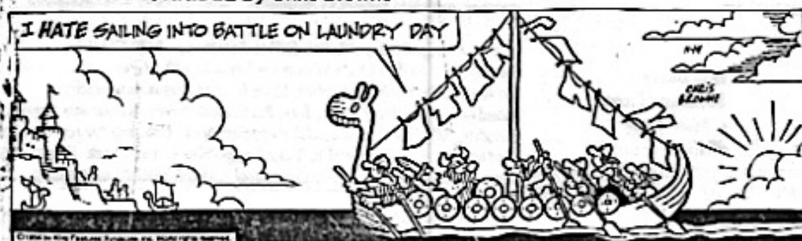
HAGAR THE HORRIBLE By Chris Browne

Amieci's—Baltimore ($ low to moderate) Very small place in Little Italy; homemade pastas with sauces than can be mixed & matched; good bread; friendly and helpful service; inexpensive and interesting wines.