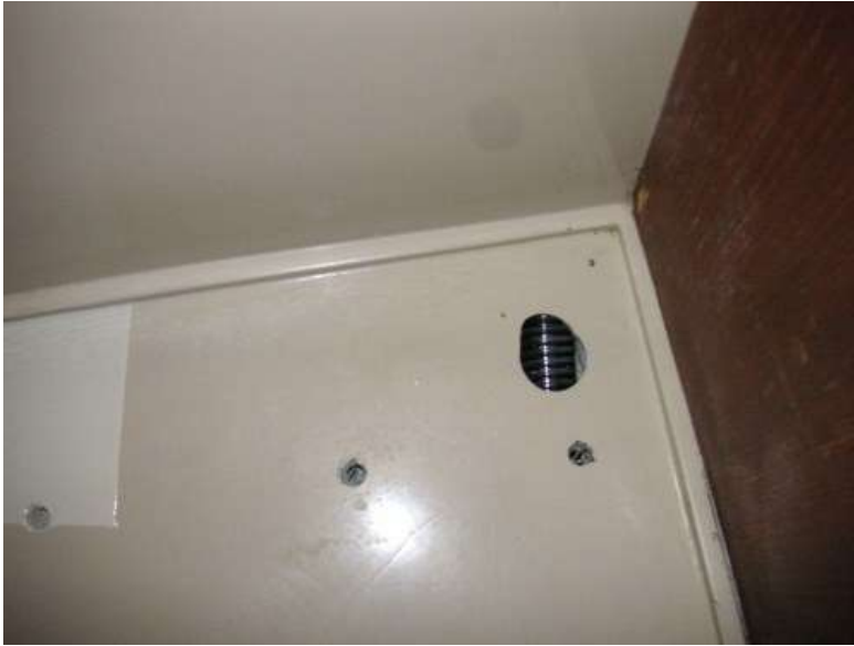
Photo (25) shows the bilge pump hoses, and the large air vent hoses passing from under the aft cabin to the aft lazarette under the aft water tank.