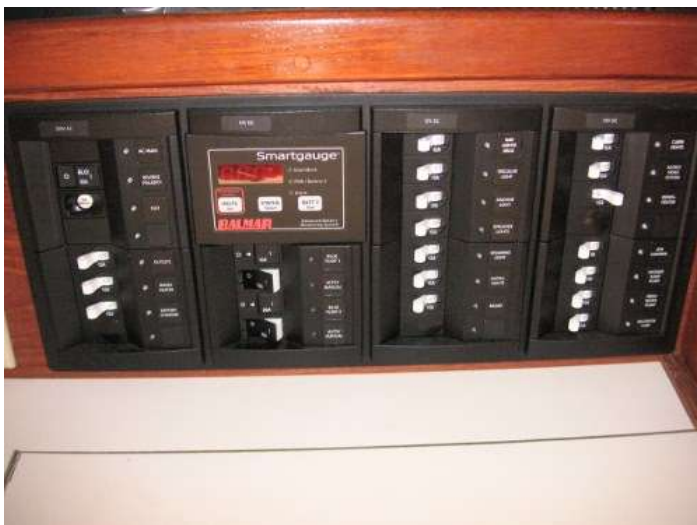
Photo (31) shows the Main Distribution Panel with both bilge pump breakers turned on. The bilge pump breakers are directly below the Smartgauge battery monitor. The Rule 1500 on/off/Auto breaker is first and the Rule 3700 on/off/Auto breaker is second. The Rule 1500 is labeled “Bilge Pump 1” and has a 10A breaker. The Rule 3700 is labeled “Bilge Pump 2” and has a 25A breaker.