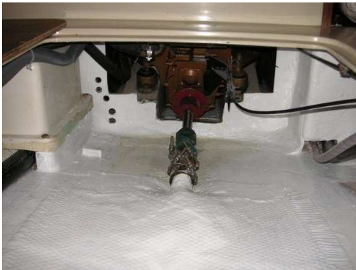
Photo (21) is taken underneath the aft cabin with the mattress and wood cover removed. The air vent lines are moved out of the way for clarity. The left side of the photo you can see the 1 1/2" bilge hoses running underneath the Aqualift muffler. It is a snug fit, but they both fit without putting pressure on the muffler. On the right side of the photo you see the 1/2" fresh water supply hose from the aft tank and the 1 1/8" bilge pump hose from the galley sink area.