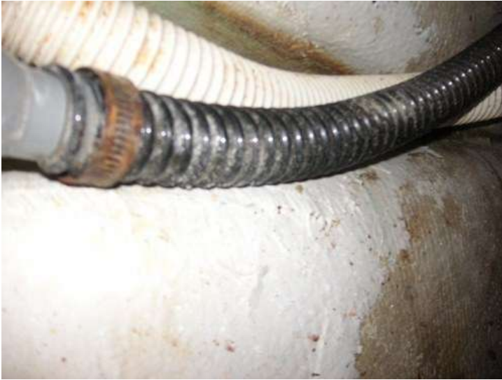
Photo (5) is the same bilge section but farther aft under the subfloor showing another rusted hose clamp on the 1 1/8" bilge hose. I point these out because this is the primary bilge pump system that could fail, even with a good pump and switch. I suggest you look at your bilge hoses and clamps, even if not planning to change anything.