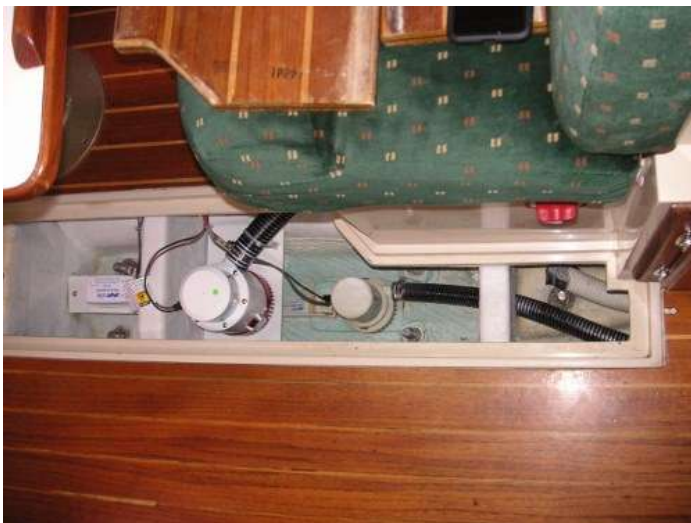
Photo (12) shows the new 2 electric pump bilge system with wires and hoses connected. Photo (13) is a closer view of the installed pumps. The 3700 1 1/2" bilge hose has a tie wrap attaching it to the shelf to pull it down to get a straight run to the pump connection.