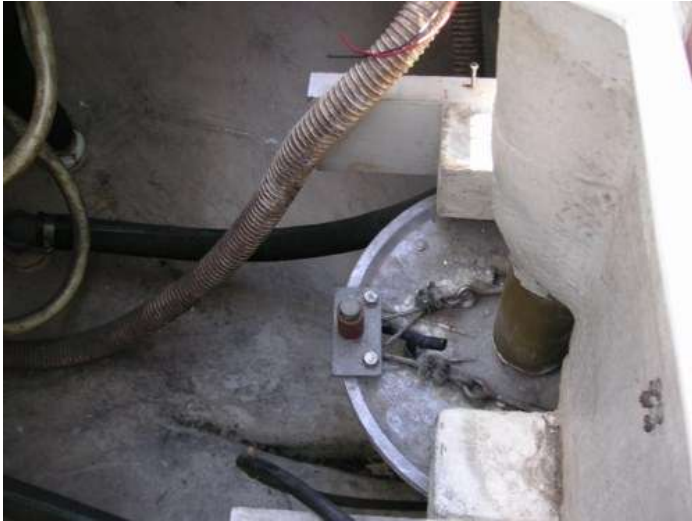
Photo (9) shows the manual bilge pump hose in the aft lazarette with the propane locker and shelf protecting the radial removed. The manual bilge hose discharge thru hull is very low on the transoms centerline just barely out of the photo. The two light colored hoses are the vent lines from the propane locker moved out of the way to get in this area to work.