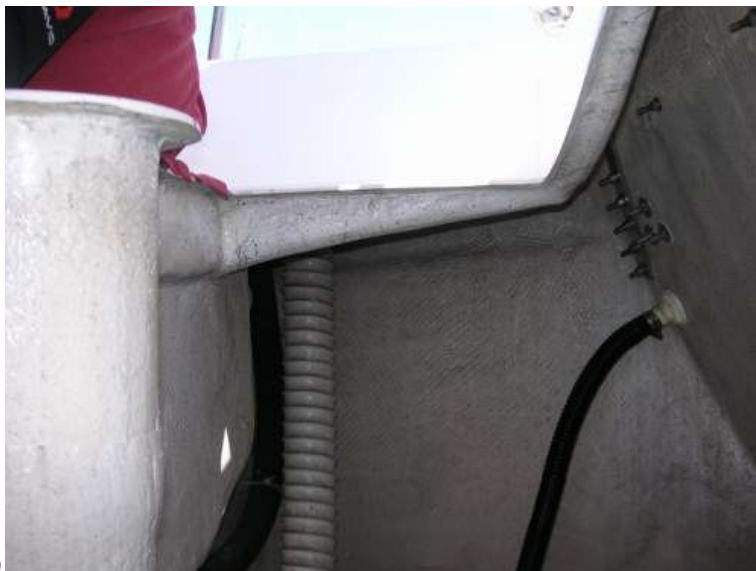
Photo (8) shows the thru hull for the 1 1/8" bilge hose. The thru hull is located high on the starboard side of the transom near the split back stay chain plate.