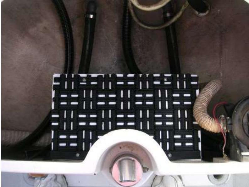
Photo (30) is of the wood cover in the aft lazarette protecting the radial from damage. I removed the propane locker and installed a non skid mat so this can be used as a step to get into the lazarette easier. I will be making a new propane locker to hold one 11# tank for the galley and one 5# tank for the BBQ. I will be installing it in the aft lazarette on the starboard side as my next project.