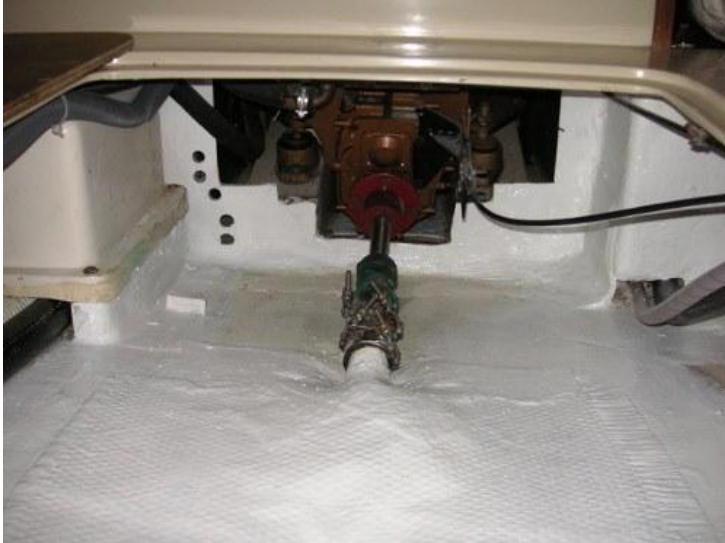
Photo (21) is taken underneath the aft cabin with the mattress and wood cover removed. The air vent lines are moved out of the way for clarity. The left side of the photo you can see the 1 1/2" bilge hoses running underneath the Aqualift muffler. It is a snug fit, but they both fit without putting pressure on the muffler. On the right side of the photo you see the 1/2" fresh water supply hose from the aft tank and the 1 1/8" bilge pump hose from the galley sink area.