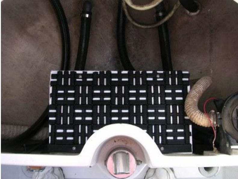
Photo (30) is of the wood cover in the aft lazarette protecting the radial from damage. I removed the propane locker and installed a non skid mat so this can be used as a step to get into the lazarette easier. I will be making a new propane locker to hold one 11# tank for the galley and one 5# tank for the BBQ. I will be installing it in the aft lazarette on the starboard side as my next project.