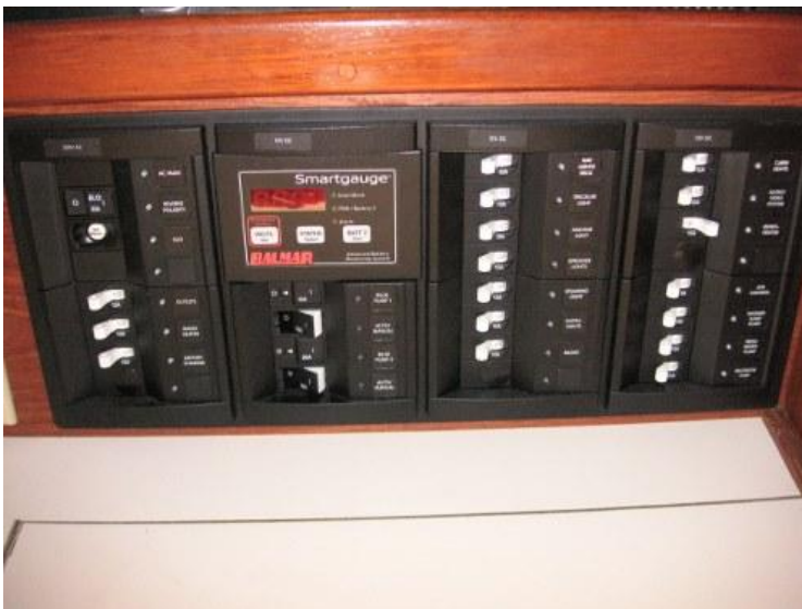
Photo (31) shows the Main Distribution Panel with both bilge pump breakers turned on. The bilge pump breakers are directly below the Smartgauge battery monitor. The Rule 1500 on/off/Auto breaker is first and the Rule 3700 on/off/Auto breaker is second. The Rule 1500 is labeled “Bilge Pump 1” and has a 10A breaker. The Rule 3700 is labeled “Bilge Pump 2” and has a 25A breaker.