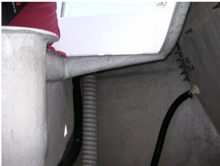
Photo (8) shows the thru hull for the 1 1/8" bilge hose. The thru hull is located high on the starboard side of the transom near the split back stay chain plate.