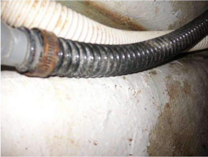
Photo (5) is the same bilge section but farther aft under the subfloor showing another rusted hose clamp on the 1 1/8" bilge hose. I point these out because this is the primary bilge pump system that could fail, even with a good pump and switch. I suggest you look at your bilge hoses and clamps, even if not planning to change anything.