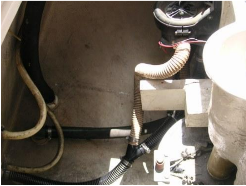
Photo (28) shows the Whale manual and new Rule 3700 electric bilge pump discharge hoses tied together and connecting to the 1.5" thru hull at the bottom of the transom they both now share.