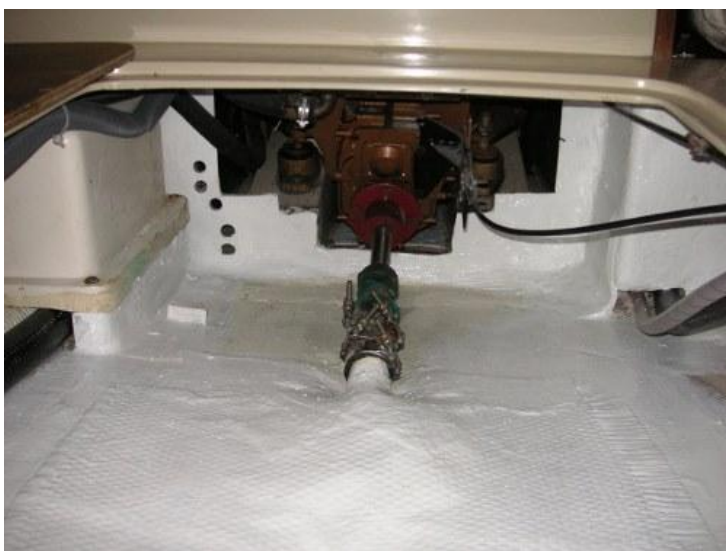
Photo (21) is taken underneath the aft cabin with the mattress and wood cover removed. The air vent lines are moved out of the way for clarity. The left side of the photo you can see the 1.5" bilge hoses running underneath the Aqualift muffler. It is a snug fit, but they both fit without putting pressure on the muffler. On the right side of the photo you see the 1/2" fresh water supply hose from the aft tank and the 1.12" bilge pump hose from the galley sink area.