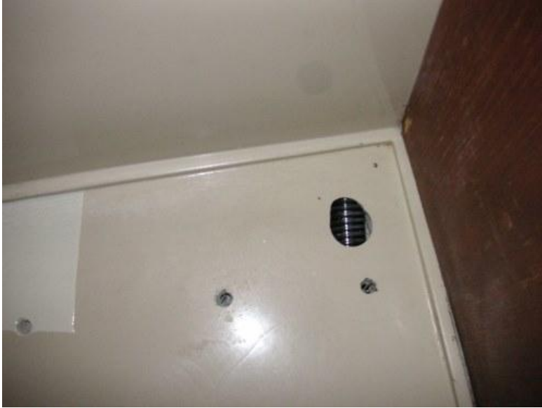
Photo (25) shows the bilge pump hoses, and the large air vent hoses passing from under the aft cabin to the aft lazarette under the aft water tank.