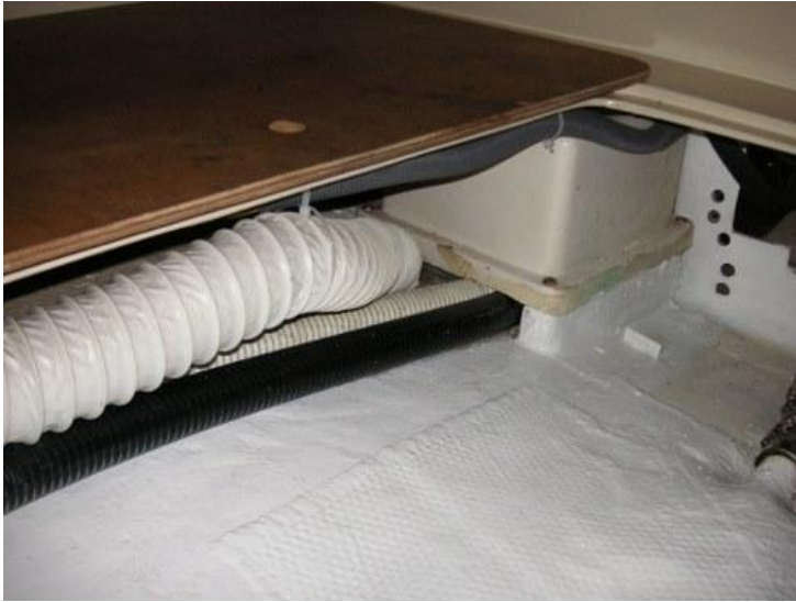
Photo (22) is a closer view of the 1.5" hoses passing under the Aqualift muffler.