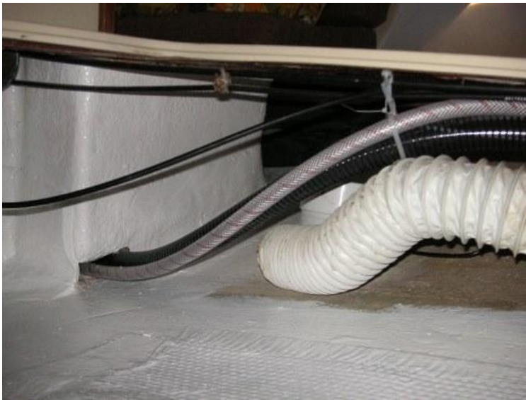
Photo (23) is a closer view of the water supply hose and the 1.12" bilge pump hose.