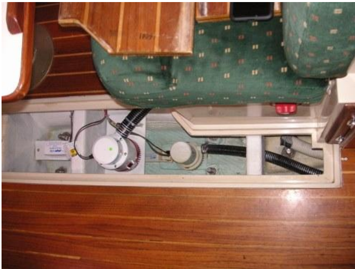
Photo (12) shows the new 2 electric pump bilge system with wires and hoses connected. Photo (13) is a closer view of the installed pumps. The 3700 1.5" bilge hose has a tie wrap attaching it to the shelf to pull it down to get a straight run to the pump connection.