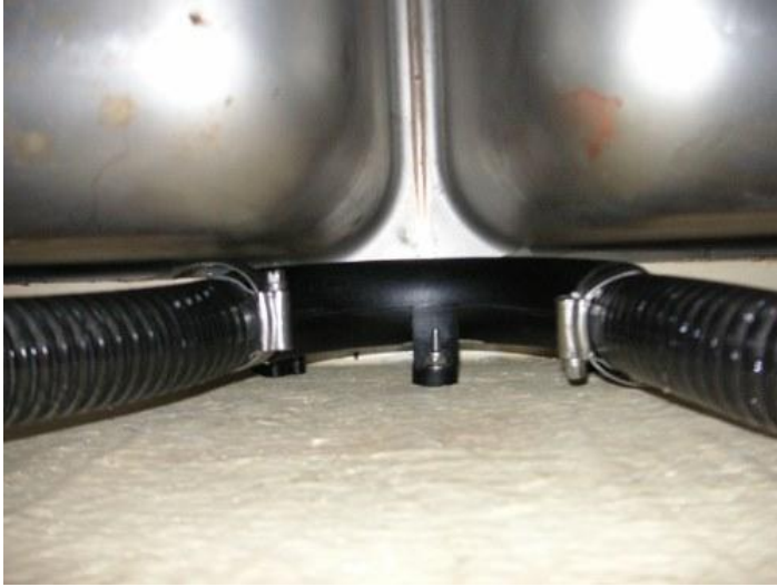
Photo (16) is a view from underneath the galley sink looking up to see the newly installed 1.12" vented loop and connecting to/from bilge hoses. The vented loop is up as high as it can go and still leave a small air gap between the top of the loop and the underside of the wood support for the galley countertop. I used my 90 degree drill adaptor to drill a hole for a #8 truss head SST screw to fasten the vented loop with a SST nyloc nut to the bulkhead. Photo (17) shows the screw head visible from the outside of the sink cabinet.