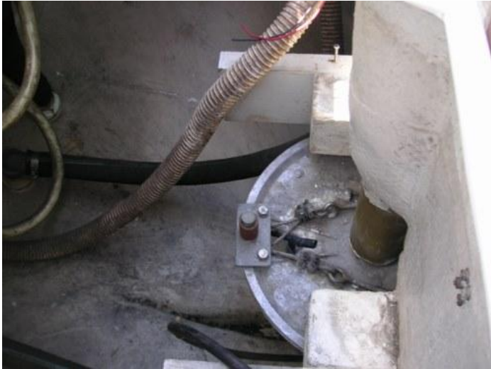
Photo (9) shows the manual bilge pump hose in the aft lazarette with the propane locker and shelf protecting the radial removed. The manual bilge hose discharge thru hull is very low on the transoms centerline just barely out of the photo. The two light colored hoses are the vent lines from the propane locker moved out of the way to get in this area to work.