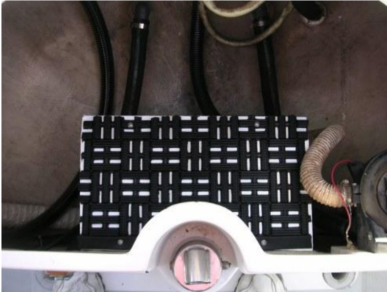
Photo (30) is of the wood cover in the aft lazarette protecting the radial from damage. I removed the propane locker and installed a non skid mat so this can be used as a step to get into the lazarette easier. I will be making a new propane locker with two 11# tanks and installing in the lazarette on the starboard side as my next project.