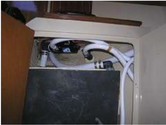
Photo (10) shows the holding tank, macerator pump, hoses, and if you look close the original wiring and cables running up to the master distribution panel at the Navigation Station.