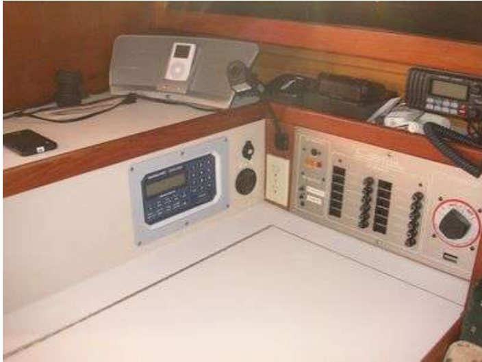
Photo (11) shows the Navigation Station with the OEM Main Panel, Link 10 battery monitor and 12VDC outlet installed by a PO. The panel has a single pole main, the polarity lights flickered, the lens for a light and the light under the battery switch were missing, the Link 10 did not operate.