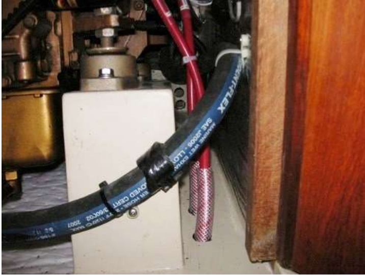
Photo (57) shows another view of the same three cables rising up to the alternator, starter, and main negative cable #14 connection on the starter motor mounting bolt.