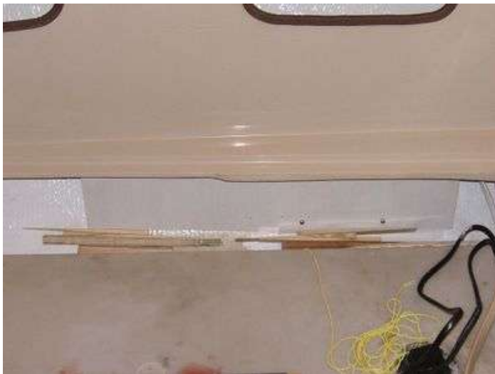
Photo (38) shows the bottom of the breadboard matched and bonded to the hull. After drying, it was repainted with white bilgekote before installing the components as shown in the next group of photos.