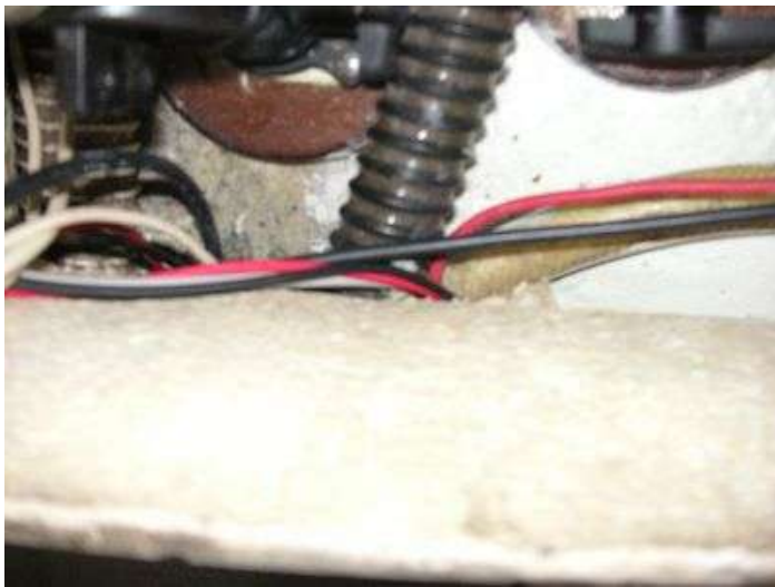
Photo (73) the external regulator wires enter the \frac{3}{4} " conduit under the shower pan. They exit the conduit by the macerator pump/motor in photo (75) of the next photo group. The black box by the Racor is part of my non-working depth/temp/speed system.