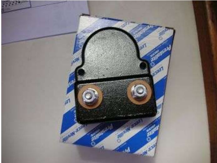
Photo (32) shows an inside view of the same assembled kit before installation.