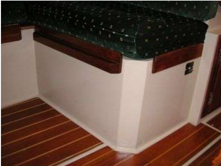
Photo (3) is the outside of the OEM battery compartment showing no ventilation openings. The switch in the upper right inboard side of the battery compartment is where the auto/on/off bilge pump switch was originally located. Photo (4) shows the original 2x Group 24 batteries, the 2 busbars, a Power Pulse battery maintenance widget, and a shunt for the Link 10 inside the battery compartment.