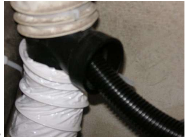
Photo (27) shows the hose supplying propane to the low pressure regulator on the externally mounted Magma grill protected by the .75" split loom entering the vent hose through a 3" x 3"x 2" sanitation tee. The tee is tie wrapped into the 3" vent hose that runs from the deck mounted cowl vent, through the aft lazarette, to the engine compartment.