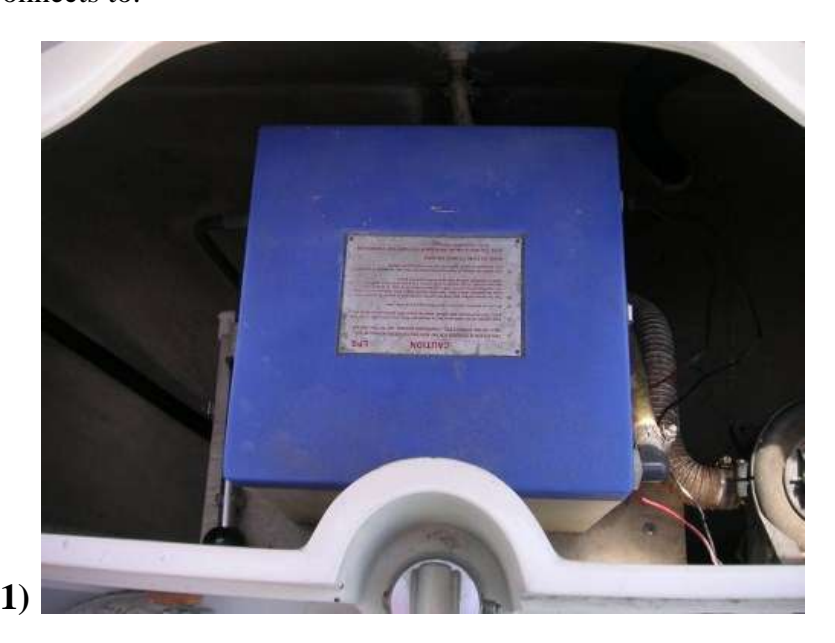
Photo (1) is the original propane locker mounted on the wood cover above the steering radial. It provides great access to the tank, gauge, and regulator. Being in the center of the lazarette opening blocks access for additional storage space. Photo (2) shows the externally threaded bulkhead fitting on the starboard side of the propane locker that the hose to the galley stove connects to.

The following photos show the boat before the propane system upgrade to help give you a perspective of my starting point. The text description for each group of photos is above them.