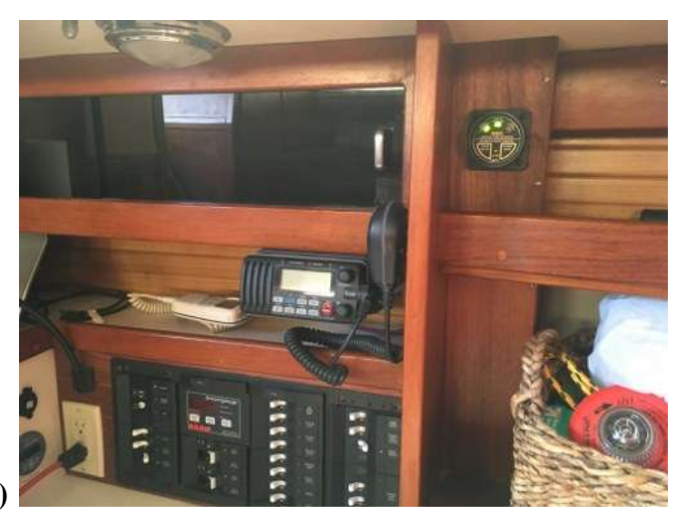
Photo (31) gives an orientation of where the S-1A is located relative to the Navigation Station desk. In this photo the S-1A display is shown powered up (the left green light) with the propane locker solenoid turned on (the center green light).

I installed the S-1A in the teak wood fascia that covers the holding tank hoses where they connect to the deck. The original teak fascia was not deep enough to provide adequate space between the hose and the back of the switch so I made new covers.