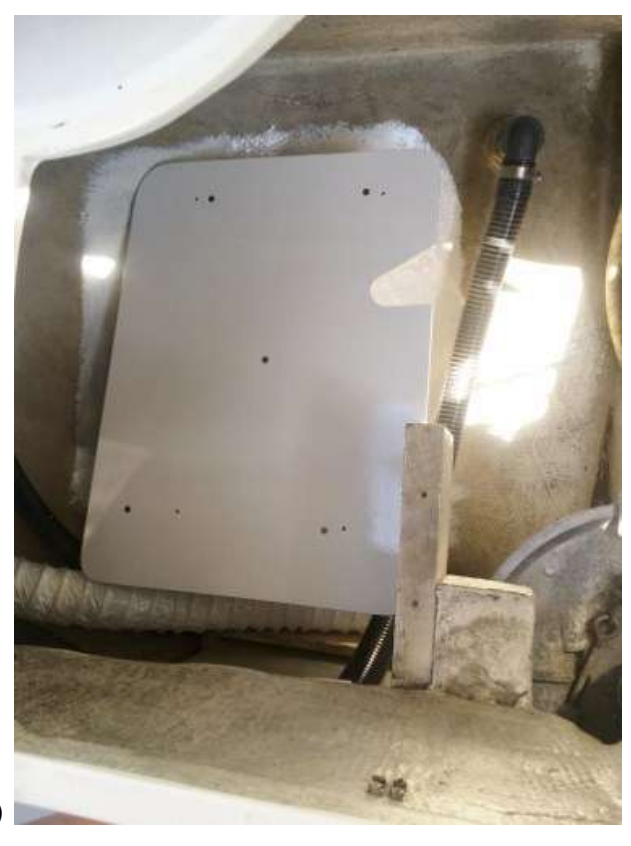
Photo (17) shows the new shelf the locker will sit on installed onto the support structure. The shelf is \frac{1}{2} " plywood primed and painted with Interlux Brightside primer and topcoat white paint. It is attached with #10-32 flat head SST machine screws with SST flat washers and SST nyloc nuts on the underside.