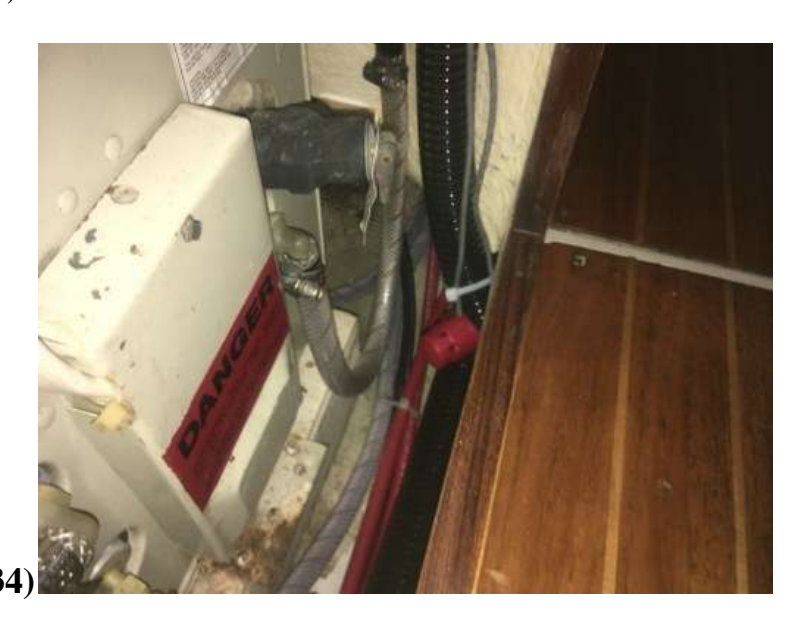
Photo (34) is a view of the installed S-1A LPG fume sensor (the red cylinder just below the cable tie).

I chose to locate it about half way between the bottom of the bilge and the underside of the subfloor. I used cable ties to fasten it to the 1 1/8" bilge hose as the hose runs vertically to the anti-siphon valve I recently installed in a bilge pump upgrade project also in the Tech Wiki. Not shown in the photo is a ½" hose that directs any discharge from the heater relief valve away from the sensor.