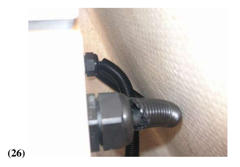
Photo (26) shows the propane hoses exiting the locker and turning before the transom. Each hose is in .75" split loom for added protection from chafe. The split loom is also intended to provide UV protection to the exposed propane hose supplying propane to the Magma grill low pressure regulator.