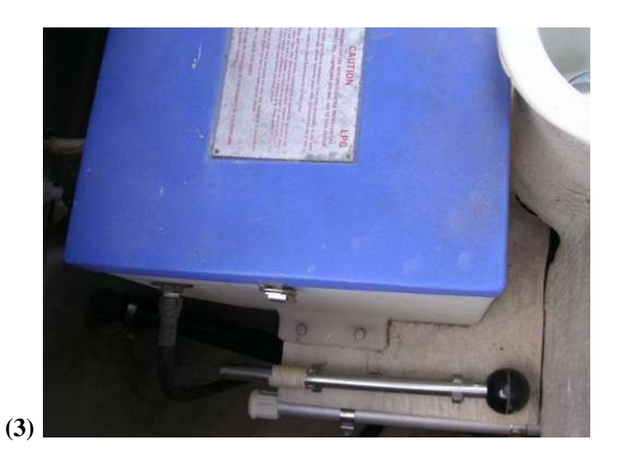
Photo (3) shows a crack in the mounting foot of the locker, and you can see one of the four SST latches used to clamp the top to the locker. Also shown are the Manual Bilge Pump and Emergency Rudder Handles mounted to the top of the wood radial cover. These will be relocated to the aft vertical 2 x 6 when the locker is relocated in the new design. Photo (4) shows the upper and lower 3/4" vent elbows and hoses.