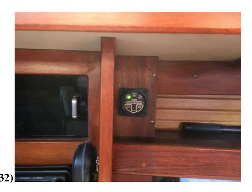
Photo (33) is a closer view of the S-1A display powered up in standby mode with the propane locker solenoid turned on.

Photo (32) is a closer view of the S-1A display installed in the teak covers and powered up in standby mode.