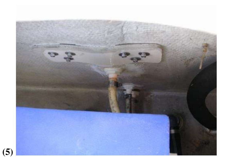
Photo (5) shows the vent hoses from the propane locker connecting to individual thru hulls in the transom. Photo (6) shows the solenoid wires exiting the locker through a hole drilled into a plastic fitting. Silicone was used to seal around the wires.