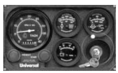
Optional Admiral Panel

■ Fresh water cooling ■ Gear driven raw water pump ■ Engine pre-wired to plug-in connector ■ Circuit breaker protected electrical system ■ E-Z bleed fuel system ■ 12 volt, 51 ampere alternator ■ Domestic hot water connection ■ Coolant recovery tank ■ Throttle, stop, and shift control brackets ■ Low oil pressure and high water temperature alarms ■ Short profile marine gear with 1.79:1 reduction ■ Glow plug cold starting aid ■ Engine matched four point, fail safe, adjustable mounts ■ Lube oil drain hose ■ Air intake silencer ■ Operators' Manual and Parts List ■ EPA certified