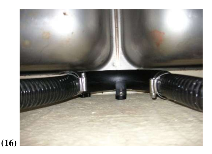
Photo (16) is a view from underneath the galley sink looking up to see the newly installed 1 1/8" vented loop and connecting to/from bilge hoses. The vented loop is up as high as it can go and still leave a small air gap between the top of the loop and the underside of the wood support for the galley countertop. I used my 90 degree drill adaptor to drill a hole for a #8 truss head SST screw to fasten the vented loop with a SST nyloc nut to the bulkhead. Photo (17) shows the screw head visible from the outside of the sink cabinet.