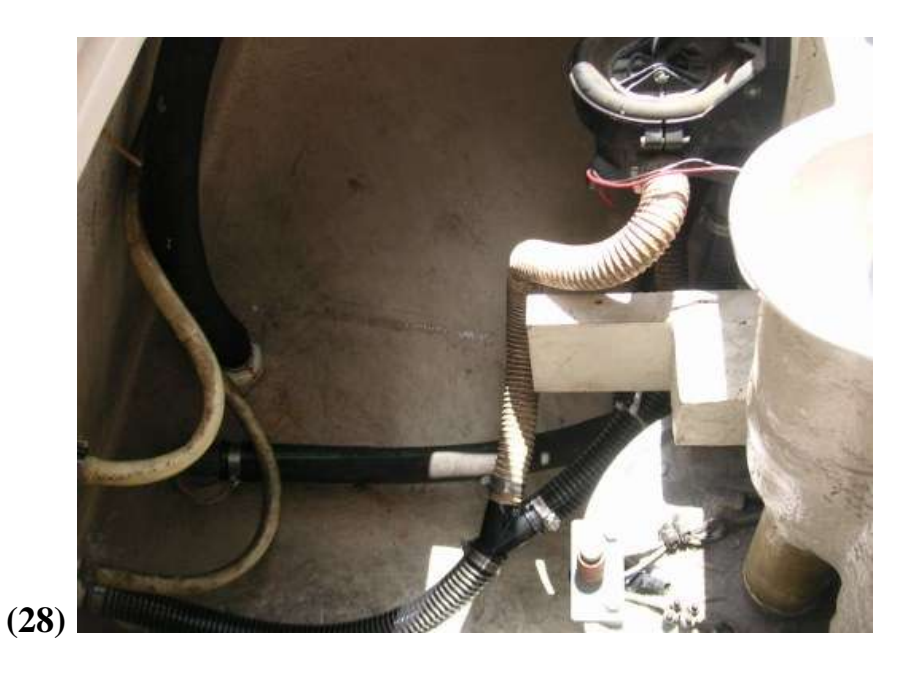
Photo (28) shows the Whale manual and new Rule 3700 electric bilge pump discharge hoses tied together and connecting to the 1\ 1/2 " thru hull at the bottom of the transom they both now share.

In photo (29), the 1 1/8" bilge hose from the Rule 1500 runs to starboard and connects high on the transom near the backstay chain plate. When I tested the system, water shot straight out of the thru hull approximately 6 inches beyond the transom.