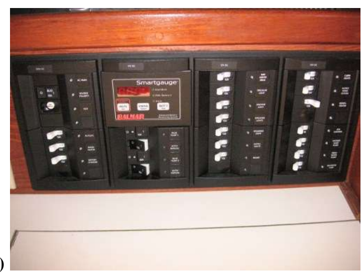
Photo (31) shows the Main Distribution Panel with both bilge pump breakers turned on. The bilge pump breakers are directly below the Smartgauge battery monitor. The Rule 1500 on/off/Auto breaker is first and the Rule 3700 on/off/Auto breaker is second. The Rule 1500 is labeled "Bilge Pump 1" and has a 10A breaker. The Rule 3700 is labeled "Bilge Pump 2" and has a 25A breaker.